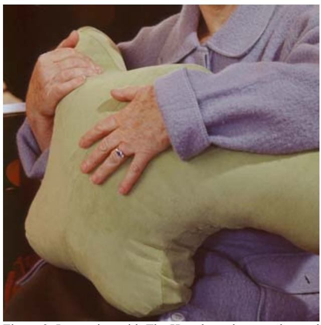
Figure 8. Interacting with The Hug through squeezing and petting.

likely resemble "smart" versions of existing products rather than science fiction visions of mechanical maids.