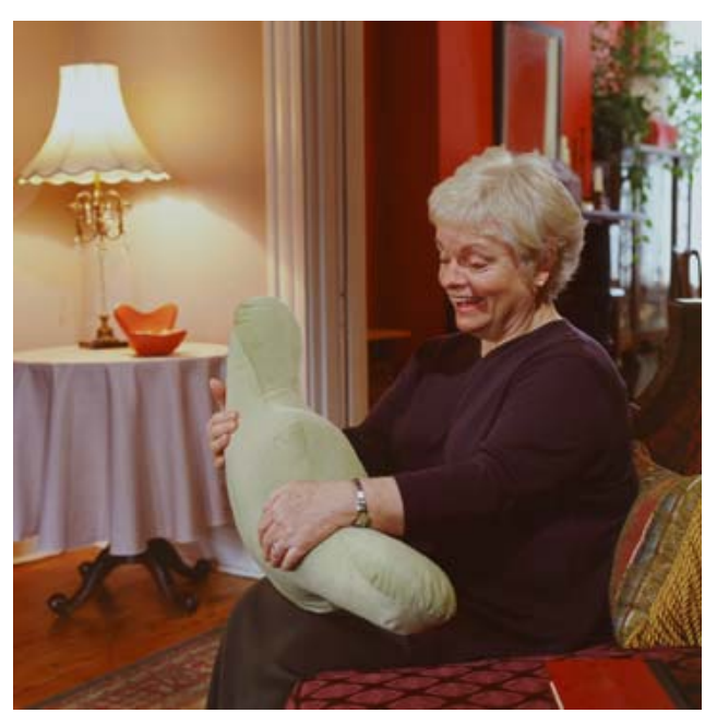
Figure 5. The Hug being held forwards in the lap.