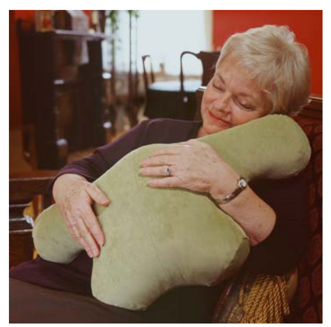
Figure 2. An example of The Hug in use.

The Hug is preceded by a large body of work exploring intimate communication and telepresence within design [8,11,17], computer-mediated communication [10], and robotics [4,13,15,18]. More broadly, our interaction design builds on research in tangible and ubiquitous computing [1,9,19], ambient displays [2,5,6,14], social computing [16], technologies for aging in place [12], and the history of anthropomorphic form in product design. The Hug is a novel design that integrates the research from