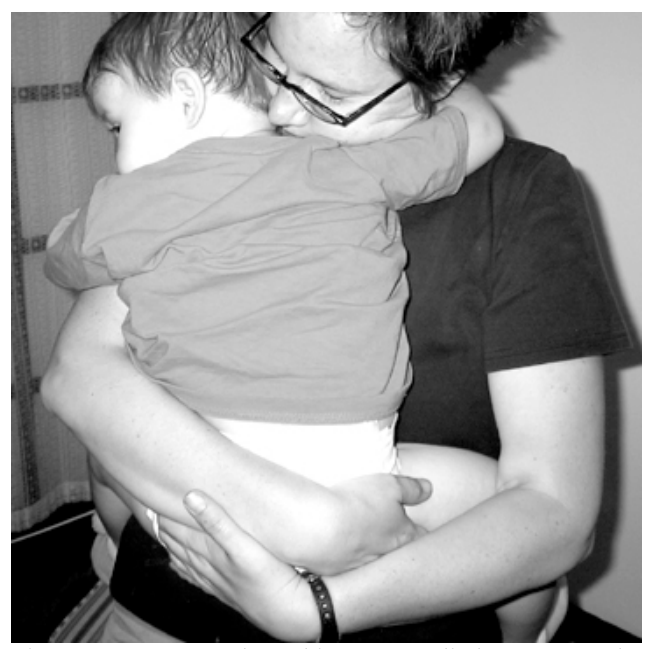
Figure 6. Images such as this were studied to capture the gesture of hugging and direct the development of form.