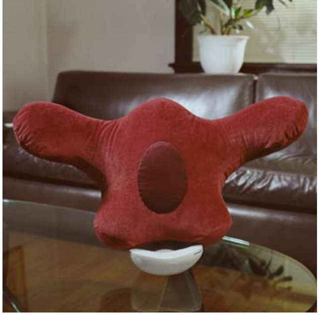
Figure 1. The Hug.

Our decision to design The Hug was informed by our research on the experience of aging [3,7]. One of the findings from our research is a pronounced need for more accessible, appropriate, and compelling communication products for the aging population. Maintaining social and emotional bonds through intimate communication is an essential human activity and characteristic of healthy family life. In our contemporary culture extended families (i.e., grandparents and their children and grandchildren) often do not live together, reducing the opportunity