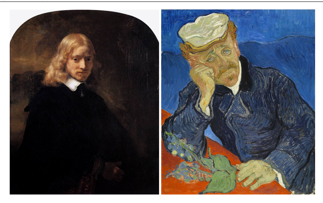
Figure 4.2: Different painting techniques tell many things about the process and can create different feelings.