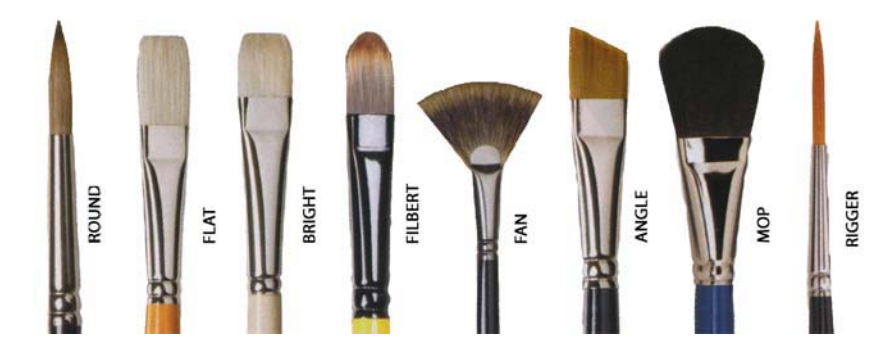
Figure 4.1: Different brush types are used to create different strokes on the canvas.

In this section we will look into brushes. Brushes are a major part of the process of painting. A brush stroke can tell you a lot about the process, the intention and the concept the artist used during the creation process.