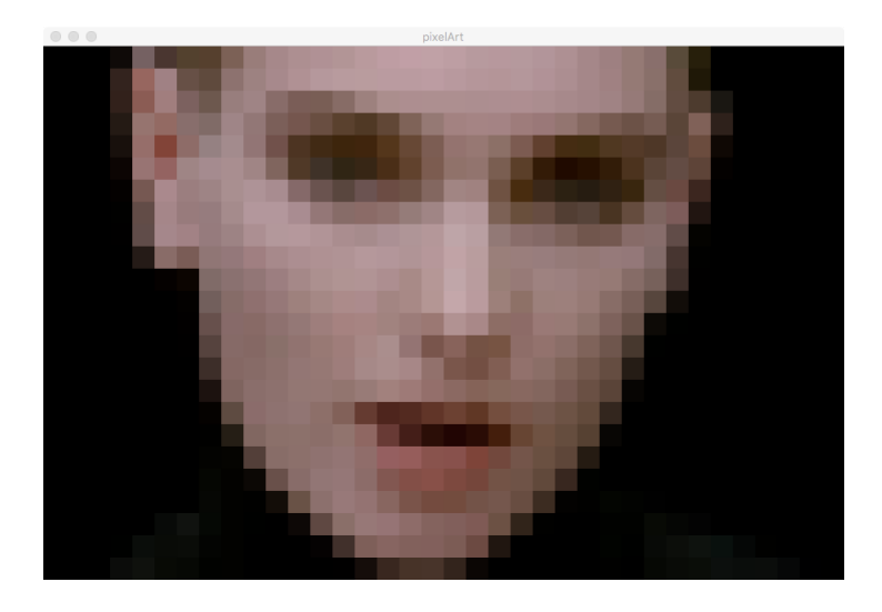
Figure 3.2: Resulting Image from the example code.