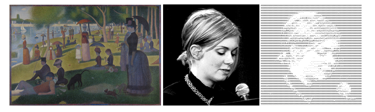
Figure 3.1: The shown examples demonstrate the translation of a color information to a interpreted output.

Implement a program that takes an image as an input, analyzes the content and transfers it to a new output design. As an example look at pictures from Pointilism, ASCII art, etc..