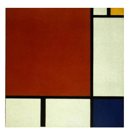
Figure 2.1: Example of a Mondrian Painting.

Implement a program that creates a drawing that is inspired by Mondrian.