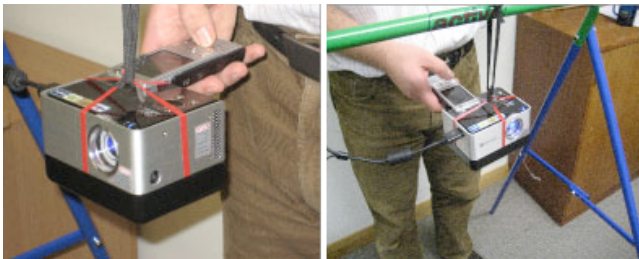
Figure 1. Prototype setup, N95 physically attached to a projector to simulate real use.

The Samsung SP-P310ME is a battery powered hand held projector, coupled with a Nokia N95 it is used to simulate a projector phone. It has a relative size of 12.7 x 9.5 x 5.1cm (w x d x h) and weighs just 700 grams (excluding battery). The projector has a display resolution of 1027 x 768 pixels. Figure 1 illustrates the experimental setup. It can be expected that when using a projector phone the user will be unable to hold the mobile phone completely steady resulting in movement of the projection. For this reason the projector is attached to a frame using elastic to simulate realistic movement of the projection.