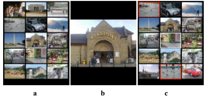
Figure 2. Mobile phone screen only image layout (a), enlarged image (b), multiple image selection (c).

For all three modalities (phone display only, projection only, and projection & phone display) by default the images are displayed as thumbnails in a grid 3 x 5 displaying a maximum of 15 images at one time. A grid of these dimensions was chosen to favor and capture the most amount of content in relation to the mobile phone screen. Figure 2a illustrates the thumbnail layout for the mobile phone.