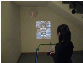
Figure 3. A user using the projection only interaction technique to browse pictures.

At a projection distance of approximately 200cm the maximum available projection size was a width of 100cm by a height of 76cm. When obeying the ratio value, a projection of 606 by 768 pixels results in a total projection space of width 60cm by a height of 76cm. Projecting the 3 x 5 thumbnail grid results in each thumbnail having a projection size of 20cm by 15cm and enlarged images having a size of 60cm by 45cm.