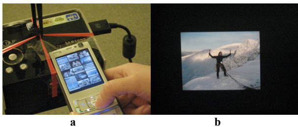
Figure 4. Phone and projection combination (a) thumbnail layout (b) User looking at an enlarged image in the projection.

Figure 4 illustrates the phone and projection interaction technique. Here the user can use both displays in parallel to browse photos. The mobile phone displays the images using a thumbnail layout (Figure 4a) as with the mobile display only technique.