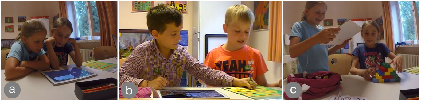
Figure 1. We present TaBooGa, a hybrid reading app that supports children’s reading motivation by combining an electronic book with tangible elements. Children read a story on a tablet (a). To progress through the story a figure of the main character needs to be moved on a physical gameboard (b). The reading task is interlaced with real world tasks (e.g., building a bridge with LEGO), which is integrated with the story by taking a picture (c).

2 LMU Munich Institute of Art Education tina.kothe@lrz.uni-muenchen.de