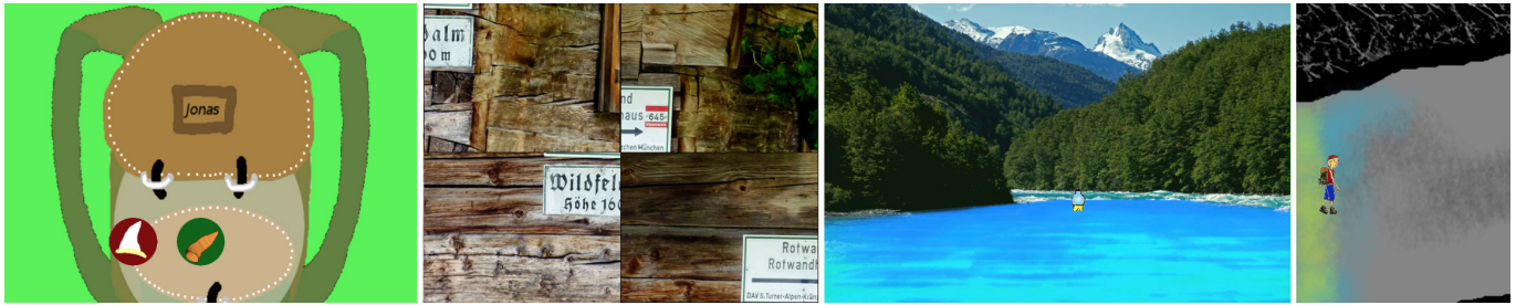
Figure 4. Two digital components support the reading task. First, the contents of the backpack (left) help readers during their task of drawing the monster, by providing hints that were presented throughout the story on the monster’s appearance. Second, three mini-games interlace the content to further increase motivation – a puzzle, a skill game, and a navigation game.

purpose is to increase the reading motivation through gaming actions, known to the children from many apps. In particular the games include a cave game, where children need to navigate through a dark cave, a skill game, where children need to fish a bottle out of the water, and a puzzle game, where children need to solve a puzzle depicting a signpost.