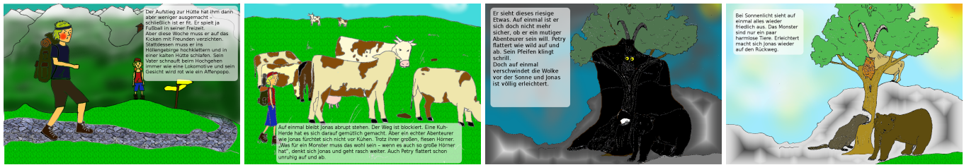
Figure 2. A Monsterly Adventure in the Mountains: on a tablet, children read the story about the main character, Jonas, who is on his way to the mountains to search for a legendary monster. Children progress through the story by means of a physical game board (cf. Figure 3). The story is interlaced with physical tasks in the real world (see Figure 3–right).