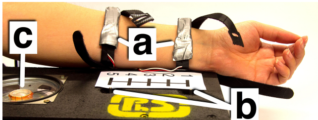
Figure 2. The PhantomStation is used to compare three actuator technologies: (a) vibrational motors, (b) linear solenoids, (c) voice coil actuators

Manifold technologies for the creation of tactile stimuli exist. Most actuators are based on moving components [2]. We compare three common types of tactile actuators (see Figure 2). The three types were chosen for their differences in the size of the generated stimuli on the skin, the disparities in stimulus intensity and the differing oscillation frequencies.