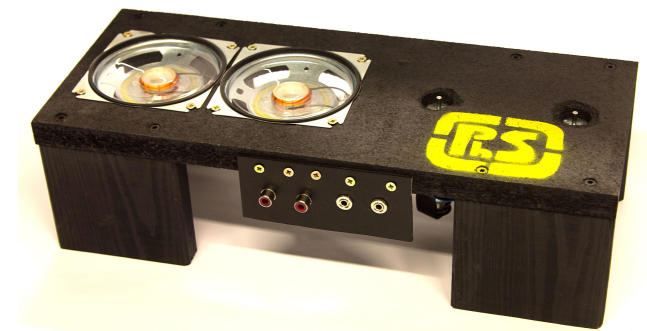
Figure 1. The PhantomStation is used to communicate a pseudo-tactile sensation to the user's forearm.

Our approach is different. We propose the spatial separation of human-machine touch input and resulting machine-human tactile output. Tactile cues resulting from a touch interaction are removed from the fingertip or hand. Using actuator technology, haptic impressions are communicated to remote parts of the user's skin. The user is able to 'feel' the surface, form, orientation and function of the virtual elements he is touching. Thus, every interactive object can give individual tactile feedback to the user. Above all, the area of tactile stimulation is not limited to the size of a fingertip. Depending on the number of actuators, an enlargement of tactile resolution is possible. We currently assess the potentials of this effect. Our goal is to improve the accuracy of touch interaction with small virtual elements.