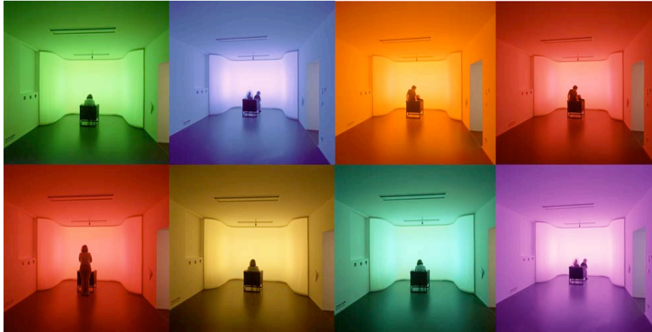
Fig. 1. Different colors generated in response to various seating positions.