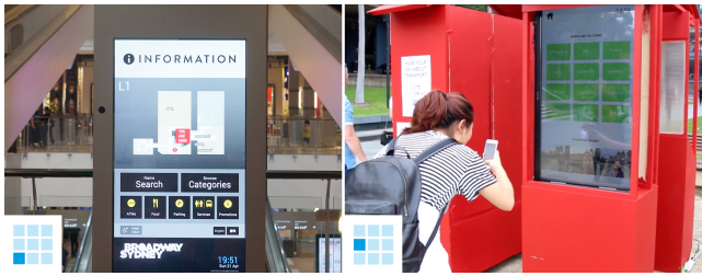
Figure 3: Permanent public display (left), pop-up public display (right). Image credits (right): [22]

3.3.2 Urban Projections. When it comes to the distribution of high-res content, projections are another very common option for creating pervasive urban displays [7, 58] (see Figure 4). Increasingly, projections in urban spaces no longer adopt projection screens, rather using the existing city architecture as target surface. These types of displays can thus easily disappear when no longer needed [12]. Projections are blended displays in the sense that the visual content is influenced by the shape and aesthetic features of the architecture it is projected on (e.g. purposely used for projection mappings [20]), and also by the material properties of the surface, resulting in different diffusing effects (e.g. previously explored for ice as a visualization material [6, 10, 48]). With the rise of pico-projectors, researchers have intensively investigated their potential in public space, referred to as Mobile Projections : for example through body worn projectors [10, 60] or projectors carried by drones [1, 36, 51], capable of showing information, such as navigation cues, on the go (see Figure 4, middle and right).