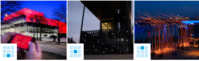
Figure 6: Blended low-resolution lighting-based displays of various mobility levels (from left to right): fixed media façade, flexible pixels and floating pixels. Image credits: ©Public Visualization Studio, [54], ©Ars Electronica / Martin Hieslmair (Flickr, CC BY-NC-ND 2.0).

of drones equipped with RGB lights (see Figure 6, right) represent the next iteration of flexible pixel systems [31]: dynamic content can still be rendered similarly to a traditional screen, yet the display is also capable to physically move and rearrange itself in space.