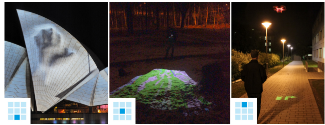
Figure 4: Projections onto Sydney Opera House (left), portable projections, with the projector carried by the user (middle), moving projections from a drone (right). Image credits: ©Jerry Dohnal (Flickr, CC BY-NC-ND 2.0), [10], [36].

On the smaller end of the resolution spectrum are Low-Resolution Media Façades , predominantly with light-emitting diode (LED) technology embedded into the outer shell of the building (see Figure