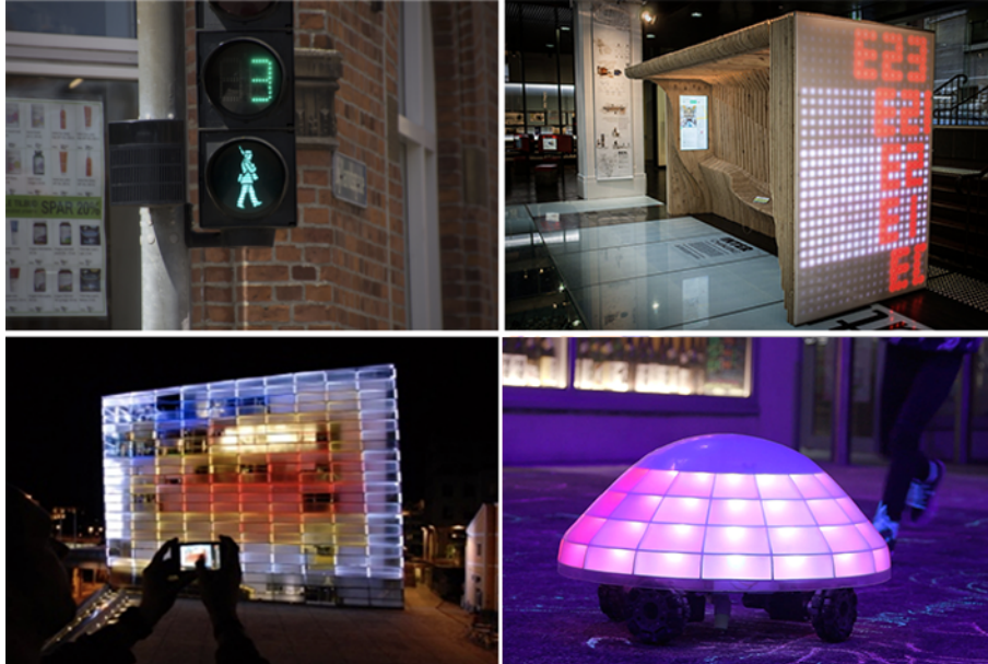
Fig. 4. Examples of urban interfaces in various application contexts to illustrate an increasing complexity: from simple traffic lights (top left), to mediated city infrastructure (top right), large-scale media facades (bottom left), and robotic urban displays (bottom right).