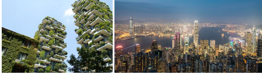
Fig. 3. Example of an eco-friendly architectural design in Milan (left) and lighting pollution in Hong Kong (right). ©Piflcn and ©Przemek Jaczewski, CC-BY-NC-ND 3.0

the role of HCI in this new urban reality. As we are confronted with novel design challenges, the question persists on how these can be addressed and linked to current design demands, such as designing an eco-friendly built environment and urban lighting overuse (see Figure 3). The abovementioned paradigm shift within media architecture also often includes new types of ubiquitous design materials distinguished from previous standard choices such as LEDs, large urban displays and projections, as the manifestation of digital media is no longer limited to stationary and fixed positions [27]. We believe that a research-through-design approach [68] is suitable to address the challenges mentioned above. It accelerates the creation of insights and knowledge on user acceptance in this emerging domain [68].