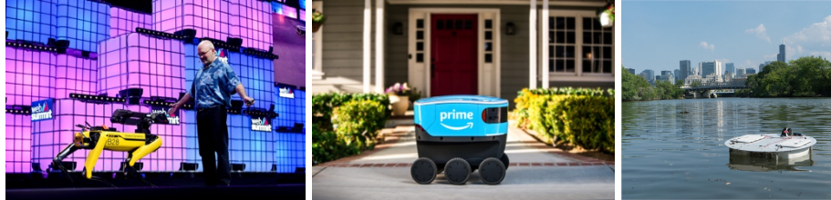
Fig. 1. Examples of new autonomous systems entering urban spaces: the commercial robot Spot by Boston Dynamics (left), Amazons Prime delivery robot (middle) and the Urban Rivers Trash Robot in Chicago (right).