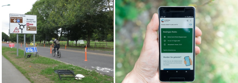
Fig. 2. Pop-up bicycle lanes in the U.K. (left) and a user interacting with a mobile virus warn app (right) as a direct consequence of an immediately changed behavior due to a pandemic.

As an interdisciplinary field and community of practice consolidating Interaction Design (IxD), Architecture, Human-Computer Interaction (HCI), and practice-led urban prototyping [30], media architecture has long been dedicated to the responsible integration of new technologies and digital media into cities. Hence, in light of these new challenges, we argue that media architecture can and should provide a solid foundation of lessons learned and methodological insights offering guidance in asking the right questions and delivering responses to this radical shift. We believe that a deeper reflection on each field's role individually and concerning the other areas can provide directions on creating meaningful dialogues between people, the built environment, and emerging technological entities living in changed urban realities. Although the changes initiated through these particular circumstances might be temporary, similar rapidly shifting crises at the city, regional or global level are regularly emerging, such as, for example, displacement caused by natural disasters, social upheaval, climate change, and the global refugee crisis. Based on that, we posit that the need to react to novel global challenges quickly will be a persisting phenomenon for the next decades, demanding technological means and prototyping strategies to respond and ensure urban resilience adequately.