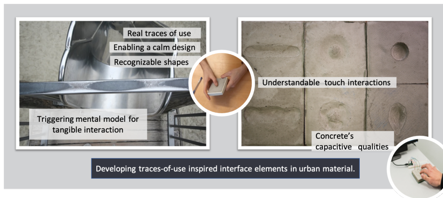
Fig. 5. Example of a human traces of use at a playground shown through colour differences (left) and UI elements inspired by this metaphor (right) realized using concrete, each in an abstract (top row) and in a used version (bottom row).

We presented the novel idea [26] of applying traces-of-use-inspired interfaces in urban environments. This design concept's metaphor was chosen as urban traces captivate due to their ubiquity, recognizability, and simplicity. Our design approach aims at augmenting the built environment with calm technologies. Furthermore, our work includes creating a universal design language for input modalities based on